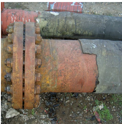
Available in 2", 4", 12" and 16" widths.