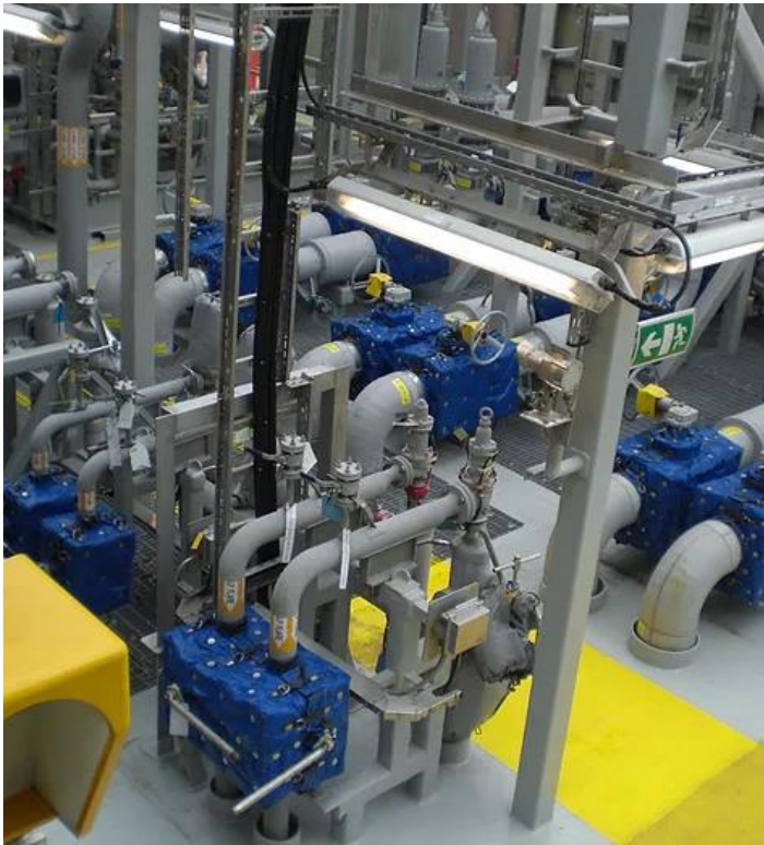
Full scale testing: